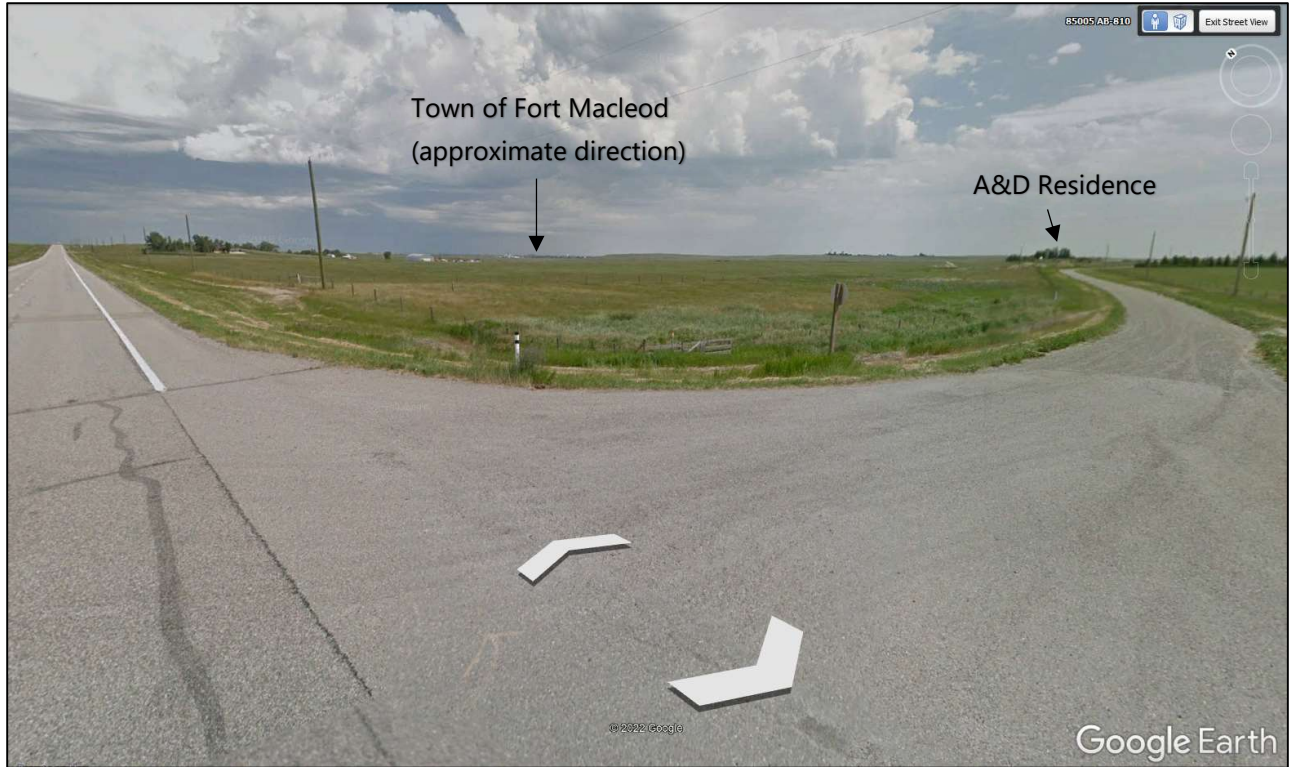
Figure 2: Google Map Street View (HWY 810 and A&D Livestock intersection)