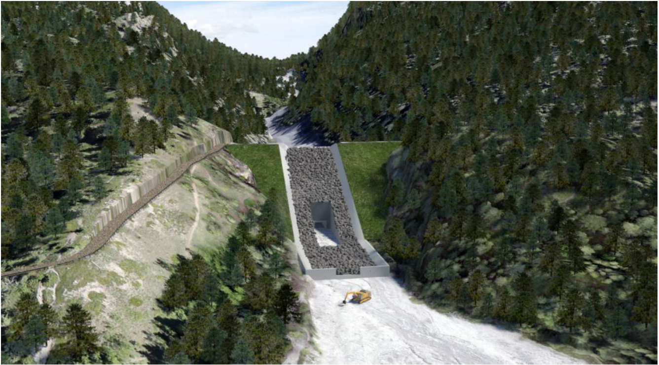
Upstream View of Preliminary Design