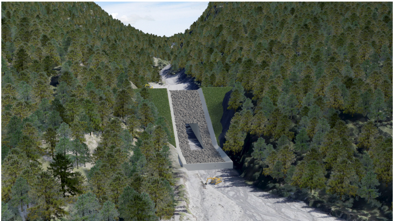
Figure 1: Rendering Option A

The first proposed option (Option A) consists of a debris flood retention structure at the site of the existing debris net. The structure is 30m high at the spillway and spans across the 45m wide bedrock confined channel. At its highest point the structure is approximately 100m wide. The basin the structure would create during extreme events would hold back up to 650,000 cubic meters of water and debris. A rendering of the structure is shown below, looking upstream.