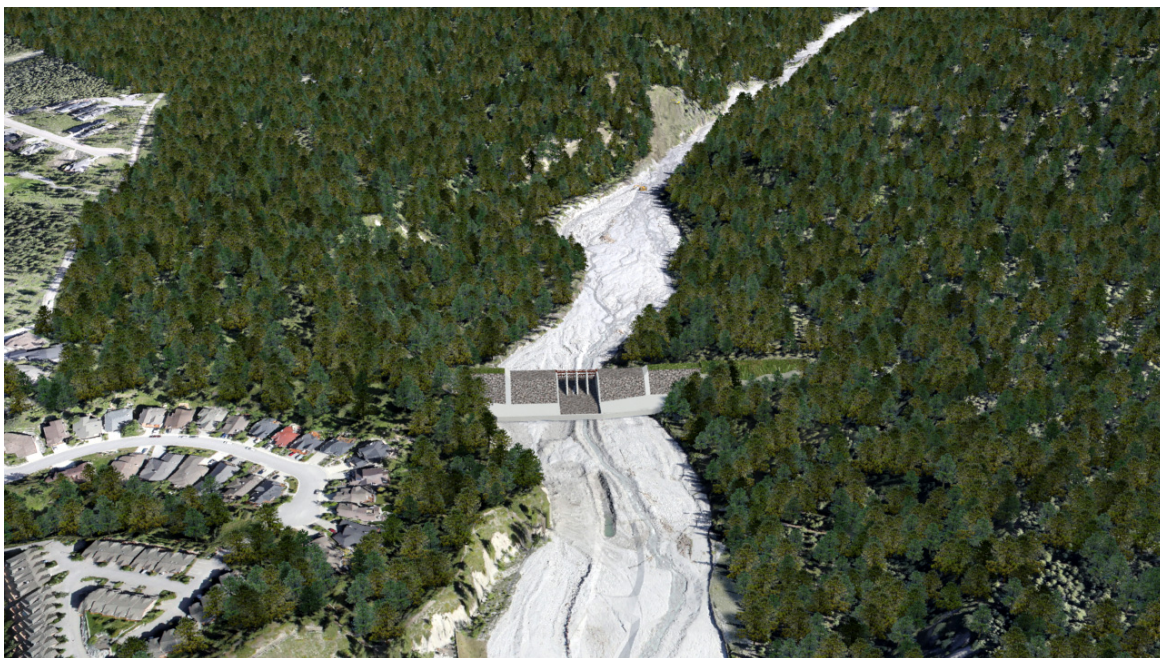
Figure 3: Rendering Option C

The final proposed option (Option C) consists of a debris retention structure at the Kame Terrace site. It is 12m high and approximately 200m wide. This structure is designed to only retain sediment, up to a maximum of 120,000 cubic meters. The water and finer sediment passes through large rake covered openings mostly unimpeded. A rendering of the structure is shown below, looking upstream.