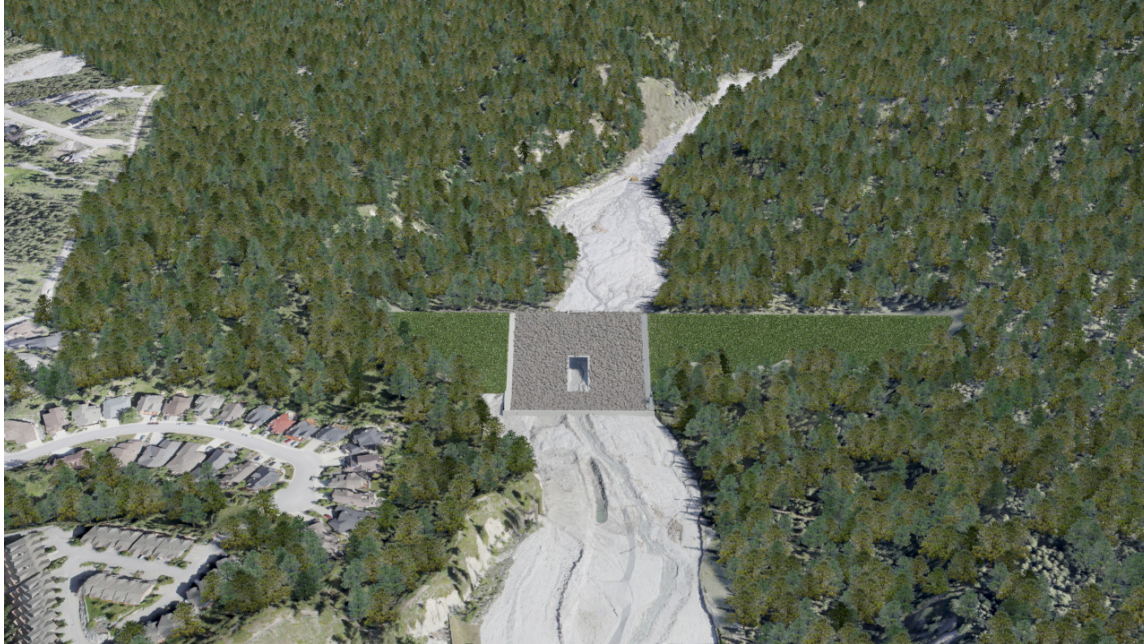
Figure 2: Rendering Option B

The final proposed option (Option C) consists of a debris retention structure at the Kame Terrace site. It is 12m high and approximately 200m wide. This structure is designed to only retain sediment, up to a maximum of 120,000 cubic meters. The water and finer sediment passes through large rake covered openings mostly unimpeded. A rendering of the structure is shown below, looking upstream.