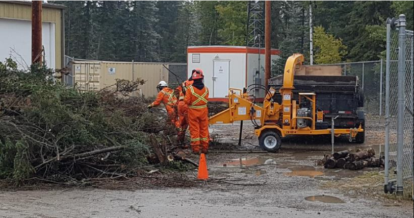
Bragg Creek Homeowner Vegetation Management – FireSmart Chipper Day (2018)

“Certain experiences and lessons should be valuable to leaders of governments and industry and with members of the general public following such an experience. Not only do we need to be world class at wildfire suppression, but we must manage our communities and our landscapes to become more wildfire resilient or we can expect similar or worse outcomes on a more frequent basis. This is not just an Alberta problem, but one that