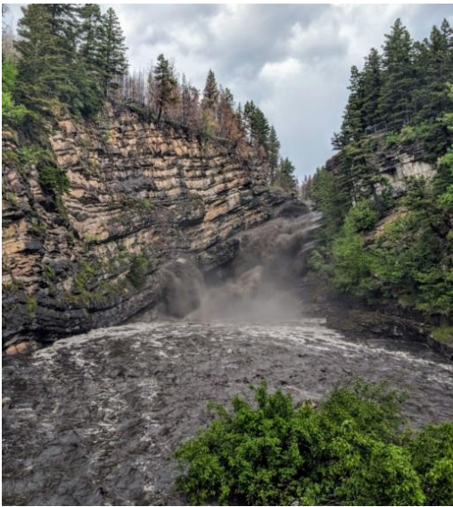
Cameron Falls, Waterton - Post Kenow Wildfire (2018)