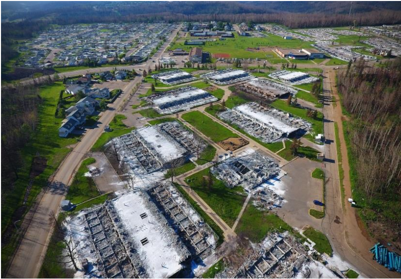
Fort McMurray Post Wildfire (2016)

It appears wildfires will continue to be a significant expense for the Province, and an area where mitigation efforts may assist with reducing the long term costs.