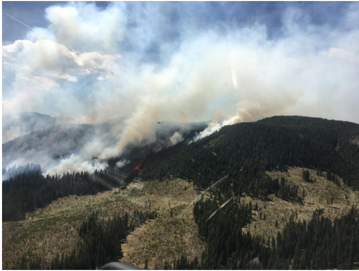
Kananaskis Country - Champion Lake Fire (2018)

At this time, the GoA is seeking permission to construct a flood mitigation project on the Elbow River at the Springbank Offsite Reservoir (SR1). An application is before the Impact Assessment Agency of Canada to consider approval of this project. The McLean Creek (MC1) Dam was evaluated by the Province as an alternative project to the SR1 site. The MC1 Dam would be located on the Elbow River in the Greater Bragg Creek Area approximately 10 kilometers south-west of the Hamlet of Bragg Creek.