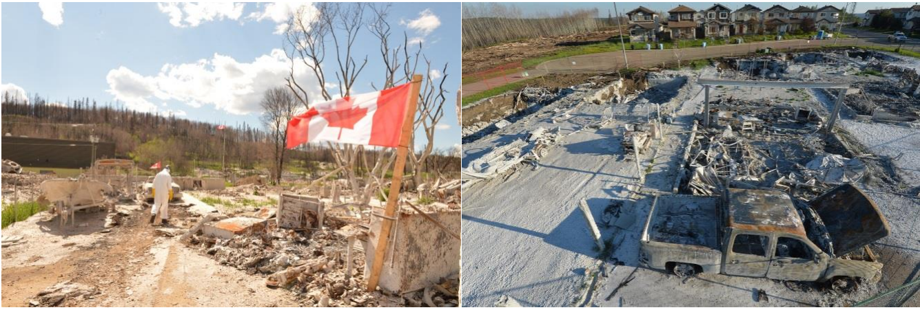
Fort McMurray Post Wildfire (2016)