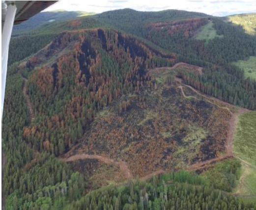
Champion Lake Wildfire, K-Country (2018)

“Wildfires are, unfortunately, a common occurrence in Alberta’s forest ecosystem and are actively managed through Alberta Agriculture and Forestry’s wildfire management program. When wildfires enter the wildland-urban interface the potential risk to property and life is significant. This risk is compounded by the increasing encroachment of communities into wildland areas, resulting in the need for continued investment in wildfire prevention and preparedness programs.” KPMG LLP provided this finding in its independent expert report prepared for the Alberta Government following the 2016 Fort McMurray wildfire. (18)