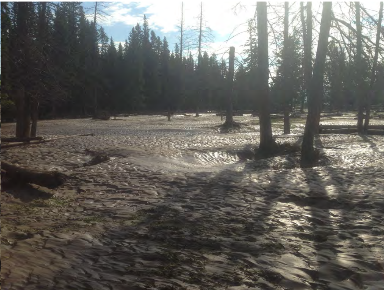
Severe silt aftermath