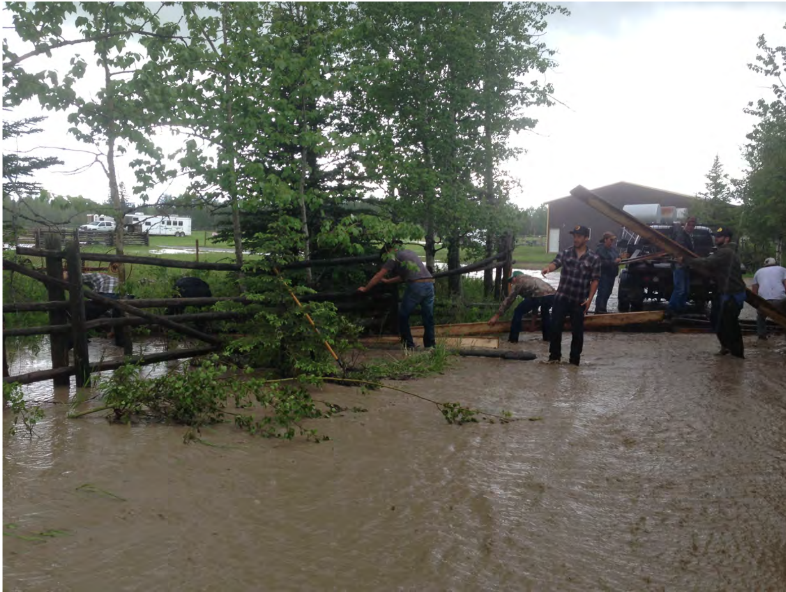
Washed out culvert and bridge. Here group is trying to divert water.