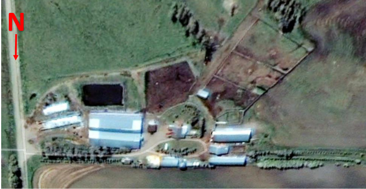
Google Earth Pro Aerial Imagery September 8, 2002